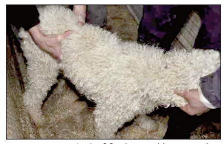
Lack of food - too thin to stand up